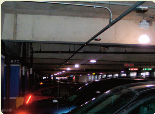
Ultrasonic directional sensors monitor individual parking spaces in real-time.