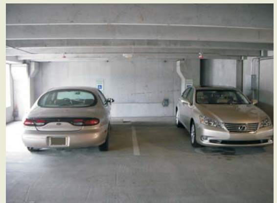
Ultrasonic Single Space Sensors monitor handicap parking spaces