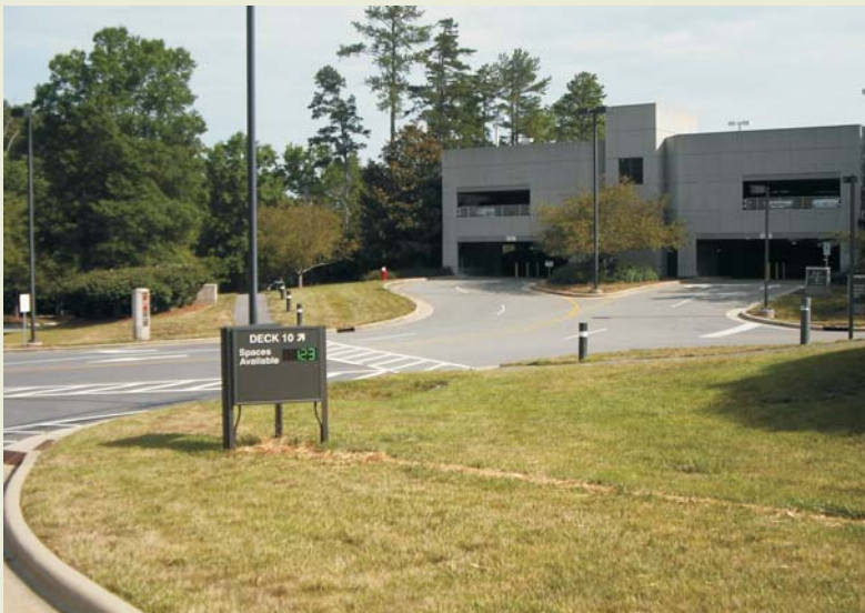
Facility roadway signs display the number of available parking spaces