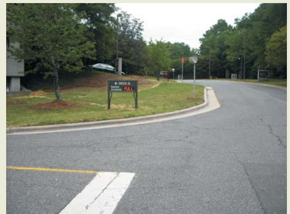
Facility roadway signs alert parkers when parking areas are full